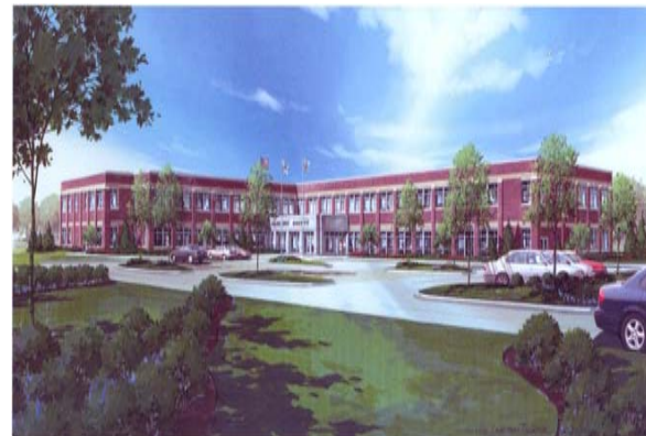
Class "A" Office