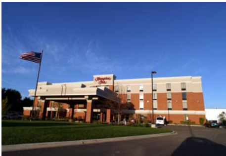
Hampton Inn—McHenry, IL