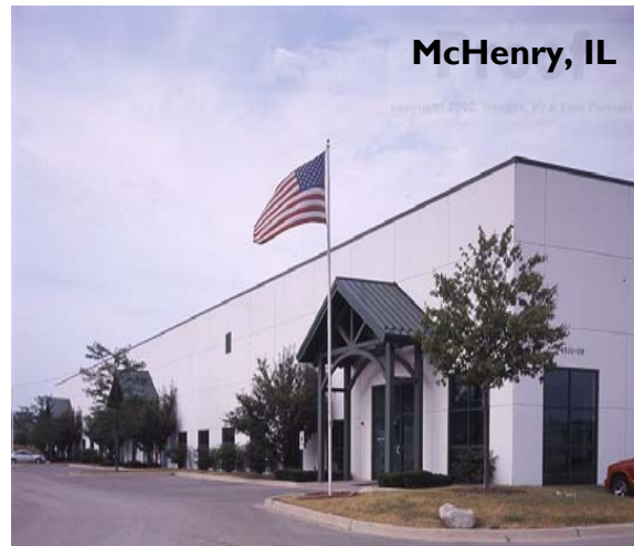
Industrial Real Estate